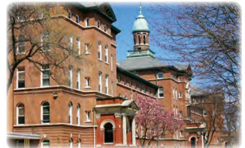
Sancta Maria in Ripa in St. Louis

four provinces are choosing to come together. Our sisters are currently in prayer and discernment, considering which of us will be elected to lead the anticipated Central Pacific Province. We will elect our new leadership team in March. We ask for your prayers as we move forward with this process.