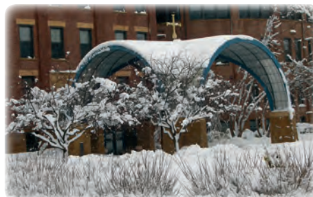
Our Lady of Good Counsel in Mankato