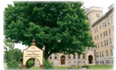
Notre Dame of Elm Grove in Milwaukee

As apostolic women religious, we are called to respond to those in need, particularly the poor, women and youth. We are committed to education that leads to the transformation of persons and to reconciliation in our world today. In order to more effectively foster this mission of God and to share our resources with one another, we