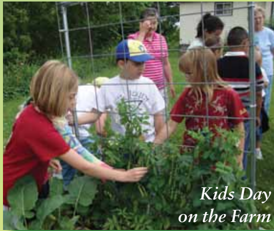
Kids Day on the Farm

Sunseed Eco-Education Ministries recognizes the continual unfolding of that sacred story within every aspect of creation, including the multiple daily experiences in our individual lives.